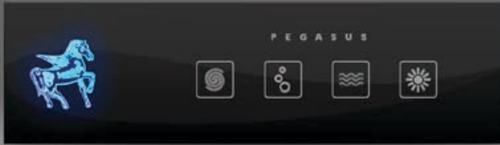
Sensations™ glass control as used with Pegasus whirlpool baths