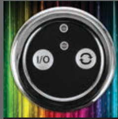
Pegasus Electronic-PLUS Chromotherapy touchpad

Sensations™ whirlpool baths include a sophisticated touch sensitive, glass control panel and four chromotherapy lights as standard.